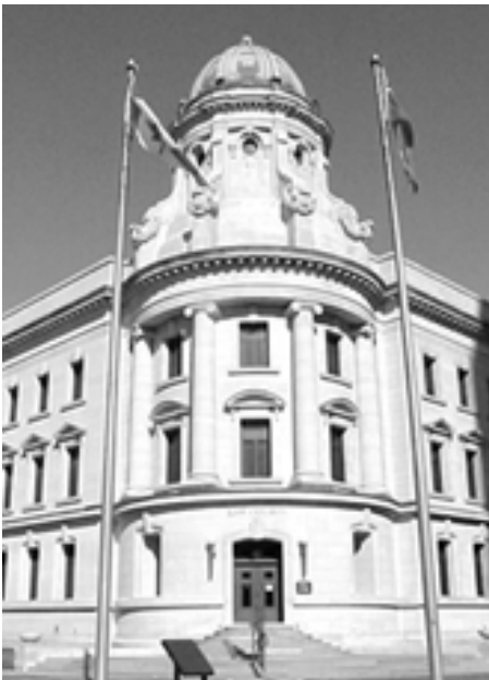
Historic Law Courts Building, Winnipeg

The focus of this issue of RESOLVEnews is "intervention as a process". In our cover story we look at the issue of reluctant witnesses in domestic violence cases, where we see that leaving an abusive relationship is a process that often involves several attempts and can entail repeated contacts between the victim and the justice system. Of course the ideal situation would be to prevent difficulties in relationships from escalating to violent encounters, which is the goal of the Winnipeg Police Service's new Family Violence Intervention Teams covered in this issue. Also discussed in this volume are school violence prevention initiatives reported by our Alberta and Saskatchewan centres, as well as Ndaawin/Our Place , an early intervention program designed to prevent the sexual exploitation of youth.